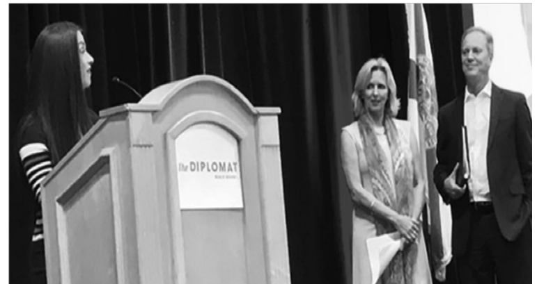
Congratulations to the new President and Board of Directors!