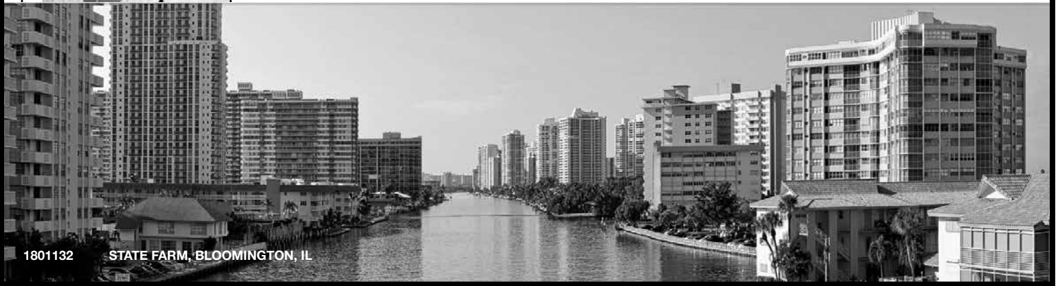
1801132 STATE FARM, BLOOMINGTON, IL