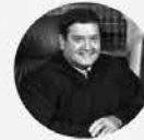
Judge Carlos Rodriguez