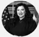
Judge Elaine Carbuoccia

FEBRUARY 25 10 AM - 12 PM RSVP REQUIRED BY FEBRUARY 23 AT 12PM