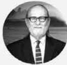
Judge Tom Lynch