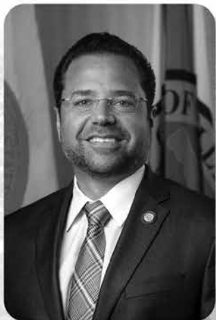
City of Hollywood Mayor Josh Levy